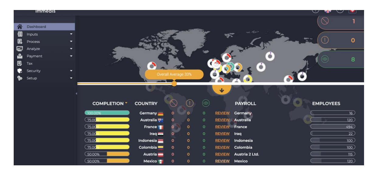
Figure 3: Immedis Dashboard illustrates completion status of each payroll. Red and Yellow notifications indicate where payroll issues need to be addressed.

Payroll teams can drill down for further data and details from the dashboard Global View to Country View, Pay Group Level, and all the way down to individual Employee Records anywhere in the world.